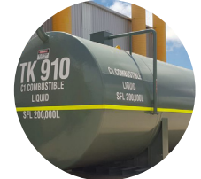
26500G SELF BUNDED