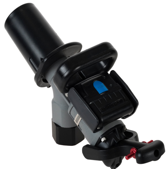
ST3000 SmartTag mounted to a Wiggins nozzle