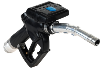
ST3905 SmartTag on a Low-Flow Nozzle

SmartTag also offers greater reliability than contact-based systems that can be affected by dirt and other build-ups.