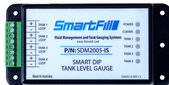
The SmartDip module

SmartDip monitors up to four tanks. It is suitable for most non-flammable liquids such as diesel, with densities ranging from 0.500 to 60 kg/m 3 . Densities can be changed by the user in case of product type changes.