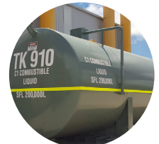
100KL SELF BUNDED