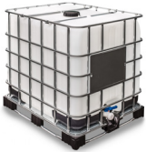
IBC FUEL TANKS