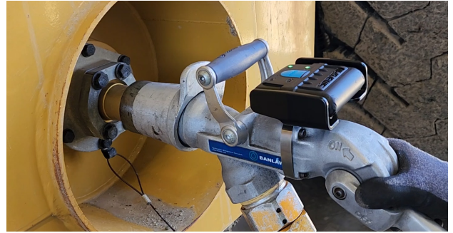
ST3000 SmartTag on a Banlaw Nozzle

SmartTag also prevents fuel theft by ensuring fuel delivery only happens when the nozzle is held in the authenticated vehicle. When the nozzle is removed from the fuel inlet, the delivery is suspended or terminated until the tag can be read again.