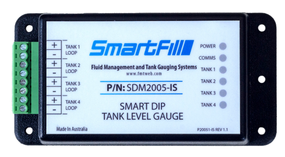
The SmartDip module

SmartDip monitors up to four tanks. It is suitable for most non-flammable liquids such as diesel, with densities ranging from 0.500 to 60 kg/m³. Densities can be changed by the user in case of product type changes.